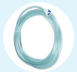
Wrinkle free tube

EFFICIENT • LARGE CAPACITY • POWERFUL INDUSTRY • RESIDENTIAL HOMES • STORES • RESTORATION